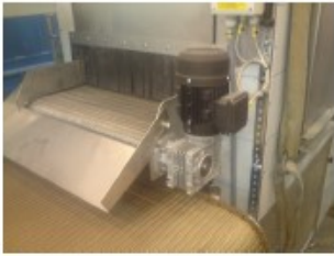
Tunnel washer with transport mat

The tunnel washers produced by Milama are based on standard designs which are then adapted to meet the demands of the customer. A tunnel washer is often integrated into an existing production chain which places both limitations and demands on performance and design e.g. type of transporter, number of steps, degree of cleaning and goods size. For this reason we've chosen not to present a specific model but adapt every machine to the needs of our customer.