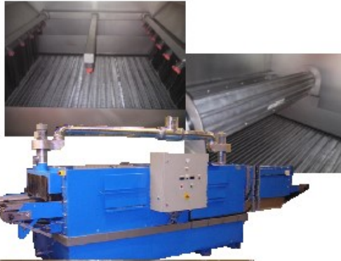
Rotating tunnel washer which collects and deposits goods in the same position