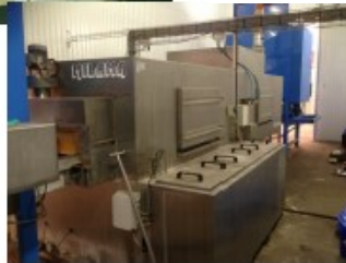
Manual or Automatic roller conveyor