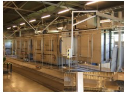
Tunnel washer with hang conveyor