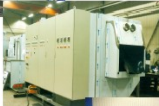
Pallet washer with pallet magazine