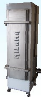
Tunnel washers in various configurations