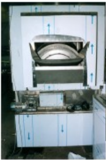
Tunnel with screw-feeder