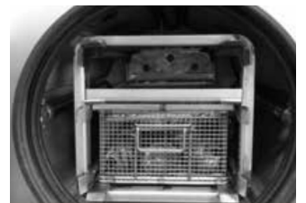
Baskets in barrel