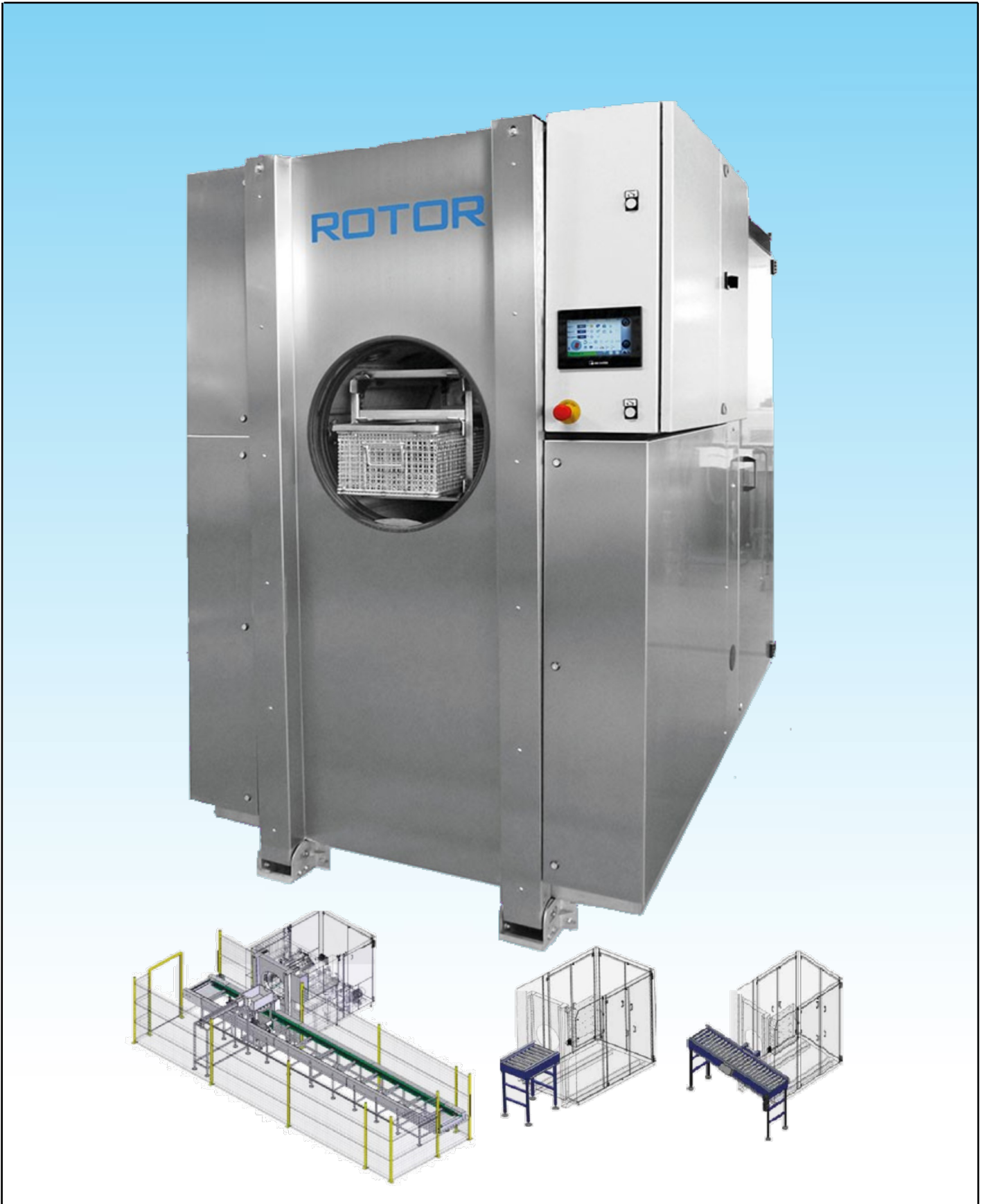
Basket washer with flushing and rotation of goods.